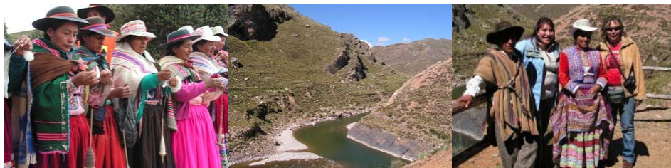
Colca Valley - Peru

The Collagua and Cabana people have revalidated their ancestral knowledge and practices, so as to make the growing demands in tourism an opportunity for fair and sustainable development.