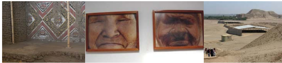
Huacas del Norte, Peru

In this regard, a documentary of the experience, featured in the international workshop "Validating Cultural Identity in Rural Territories: Experiences and Perspectives", presented in Cartagena de Indias, Columbia, can be highlighted, in addition to the soon to be inaugurated On-Line Learning Community for the strengthening and the putting into practice of lessons learned and the planning of a second Path.